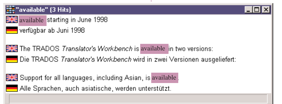
Figure 4: The Result of a Concordance Search