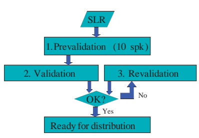
Figure 1. SLR validation procedure in SpeechDat-related projects

As shown in Figure 1, validation in "SpeechDat style" proceeds in three steps: 1. Prevalidation of a small database of about 10 speakers shortly after the design specifications have been established and the recording platforms installed. The objective of this stage is to detect serious (design) errors before the actual recordings start. This stage also allows partners to build their database compilation software in an early stage of the project. This corresponds to strategy (3) in Table 3.